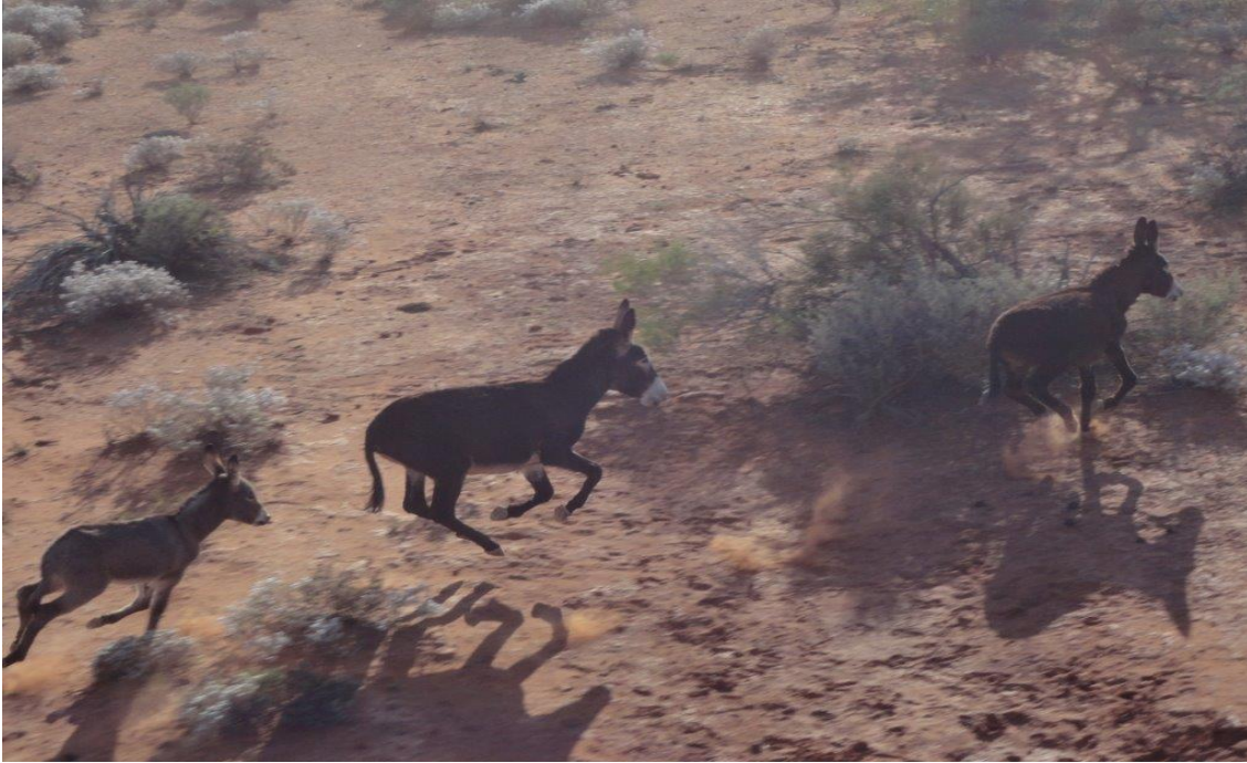
LFH Aerial Control