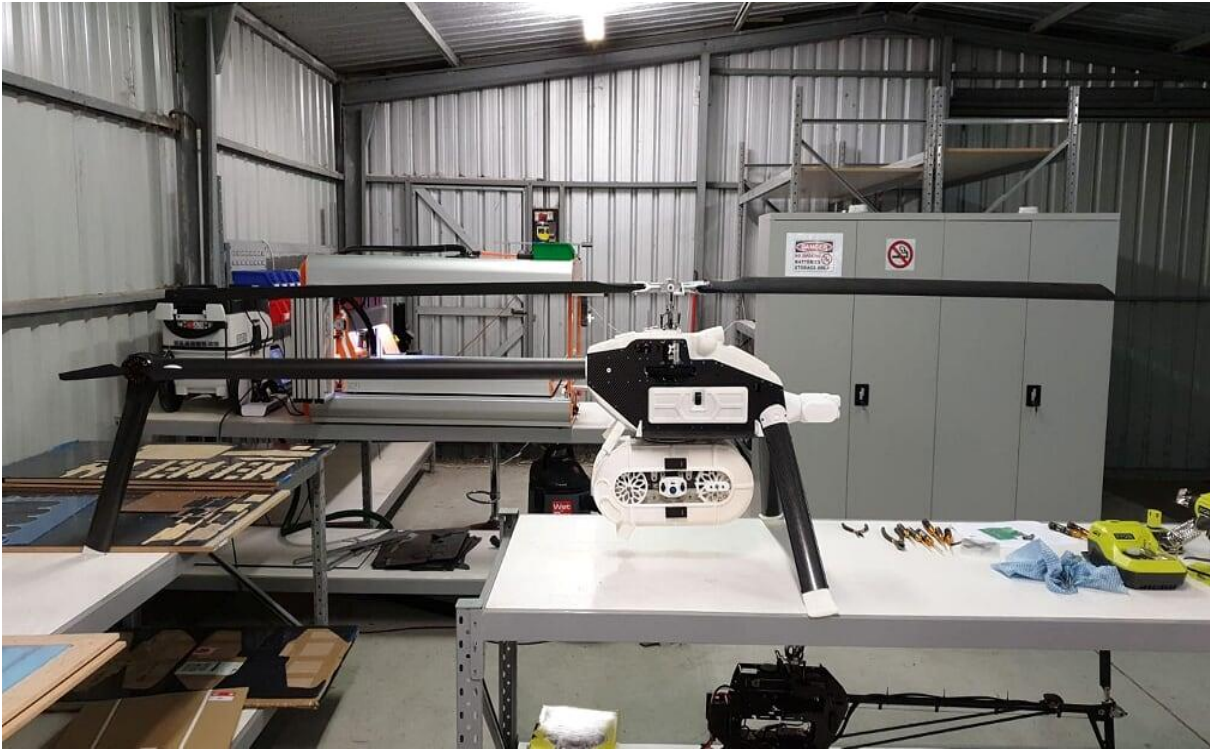
Autonomous Technology Drone Fitted with Bait Delivery System