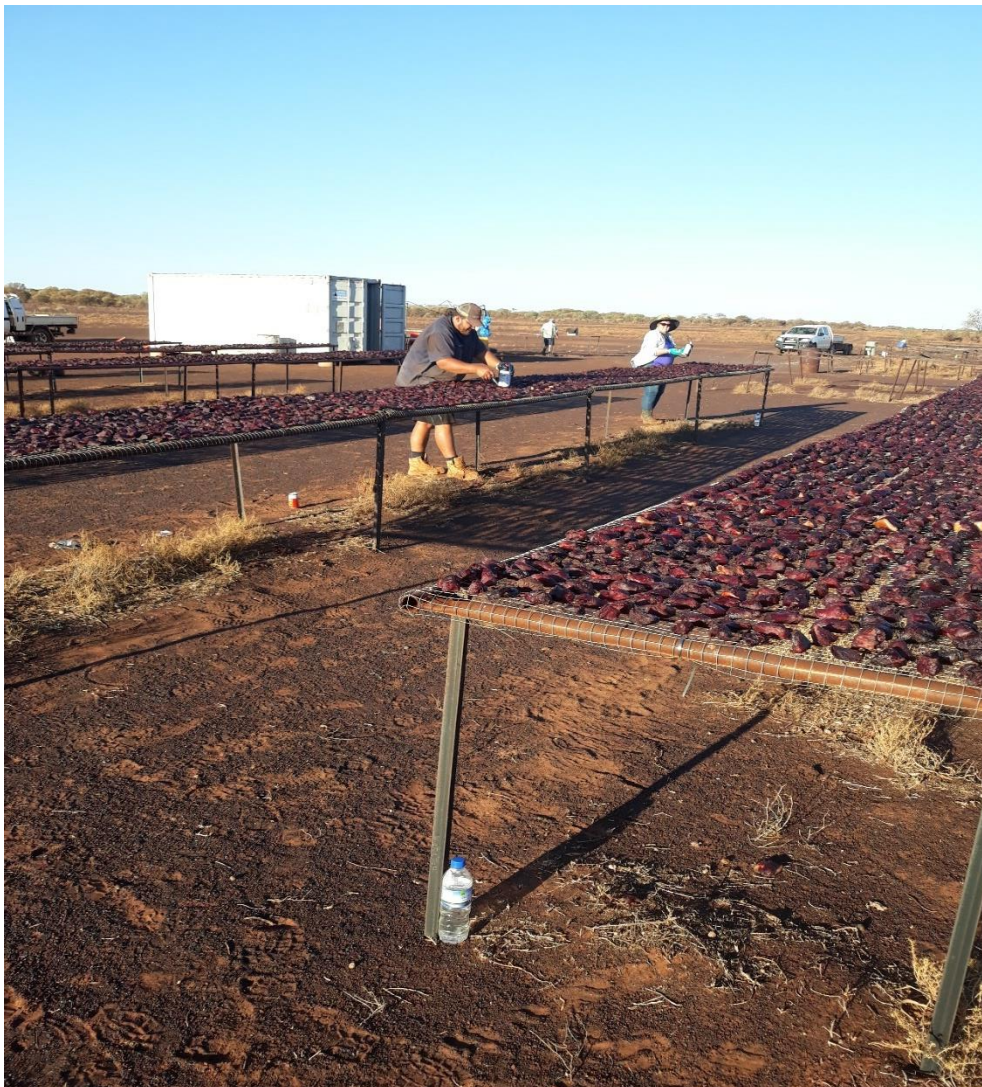
Illrararies Bait Racks

The MRBA community baiting program operates on the basis that a co-ordinated approach, where all pastoralists lay baits within the same time frame, is a fundamental component of a successful wild dog reduction program. Further details of the community baiting program are contained in the MRBA Wild Dog Management Plan which is available on request.