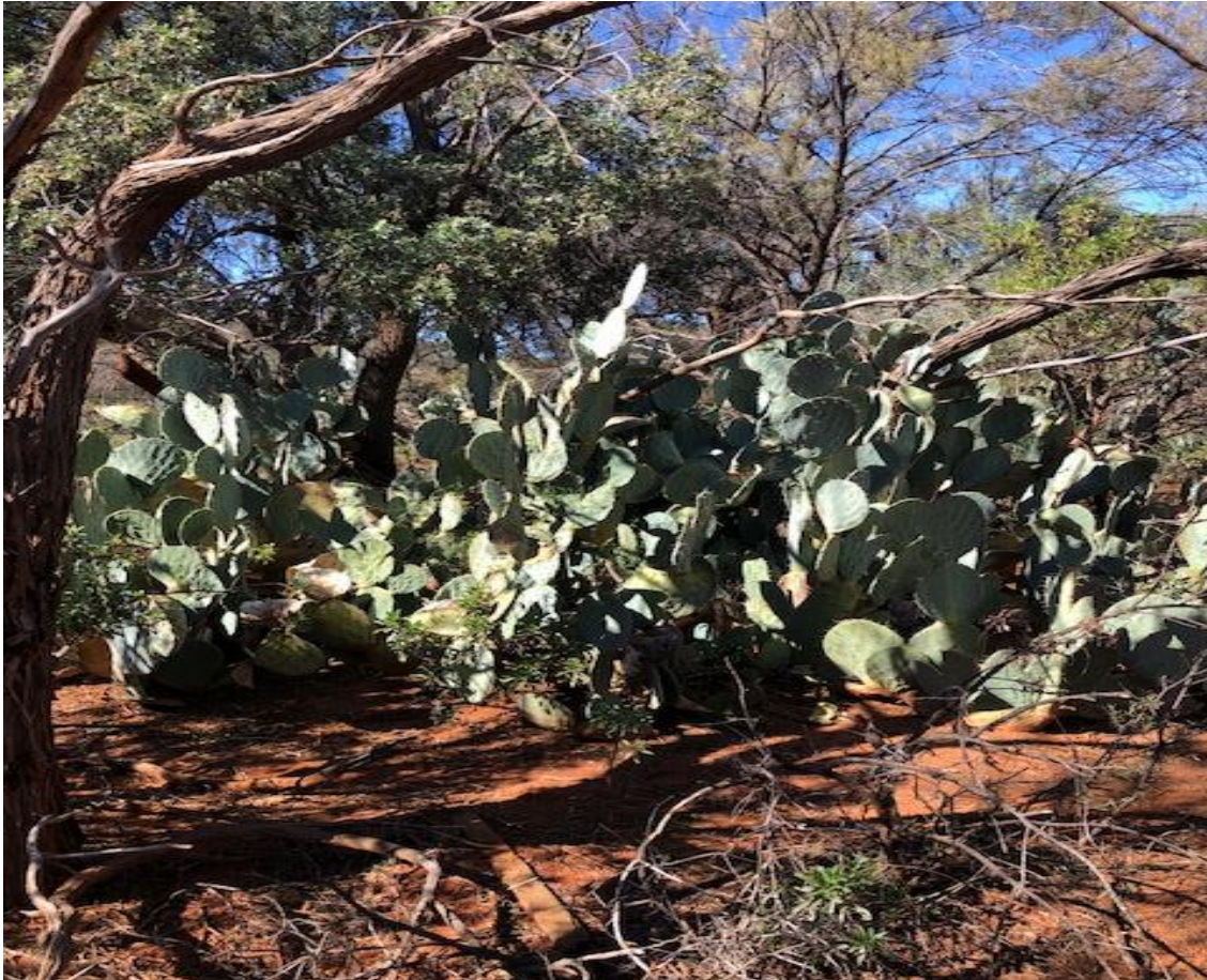
Cactus Infestation – Yandil - Paroo Station